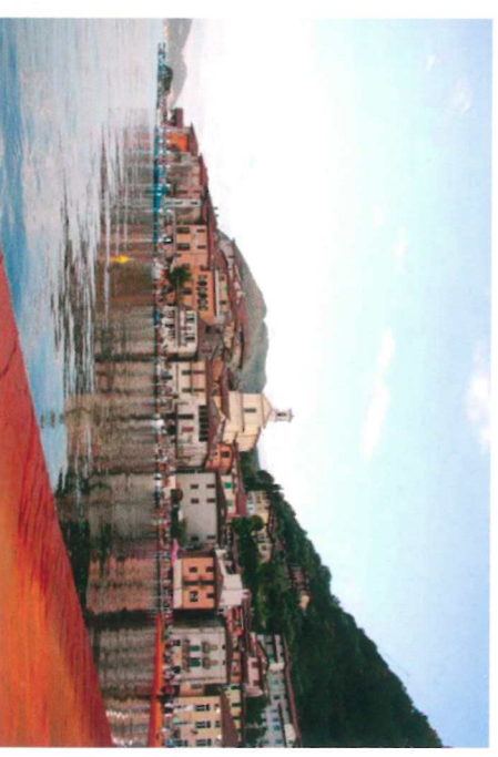
Monte Isola – The Floating Piers, 2016